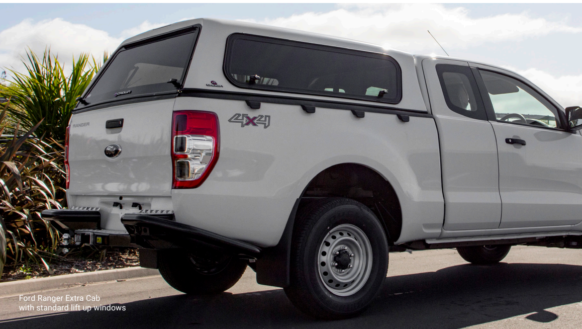
Ford Ranger Extra Cab with standard lift up windows

Roof Rack Mounts carry your load on the canopy roof, with load rated roof racks.