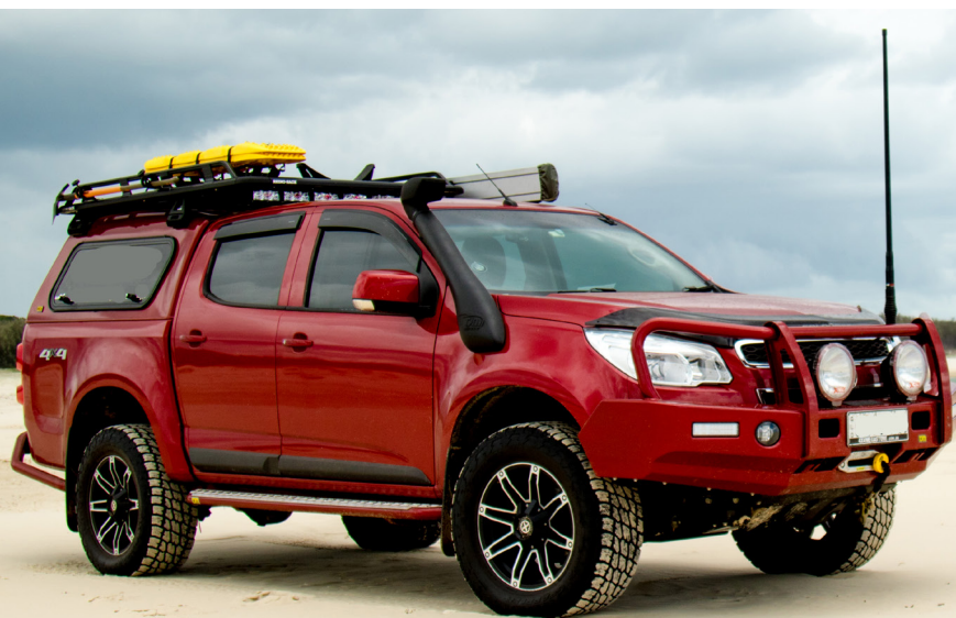
Holden Colorado Double Cab with standard lift up windows and reinforced for roof racks

Roof Rack Mounts carry your load on the canopy roof, with load rated roof racks.