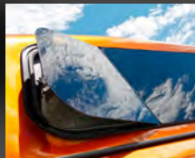
FLUSH MOUNT SCISSOR