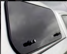
FLUSH MOUNT LIFT-UP