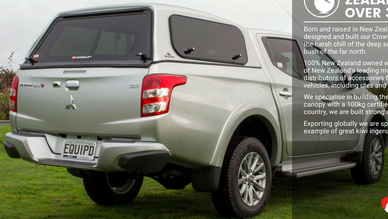
Mitsubishi Triton Double Cab with flush mount lift up windows