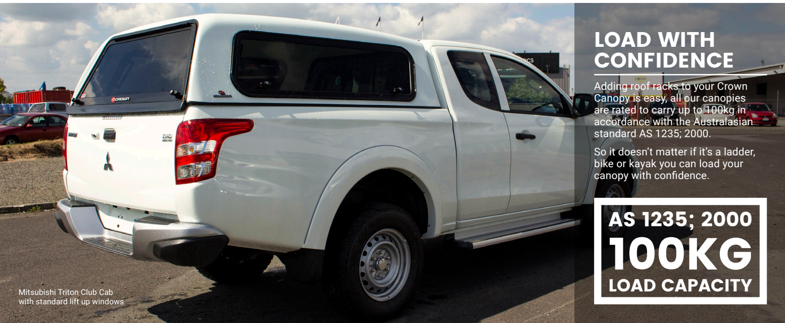
Mitsubishi Triton Club Cab with standard lift up windows

Roof Rack Mounts carry your load on the canopy roof, with load rated roof racks.