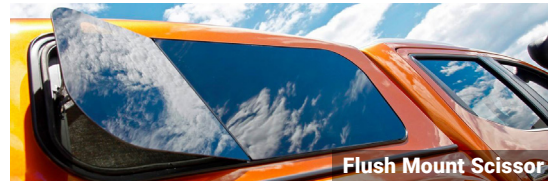
Flush Mount Scissor