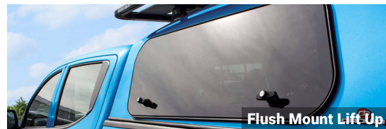
Flush Mount Lift Up