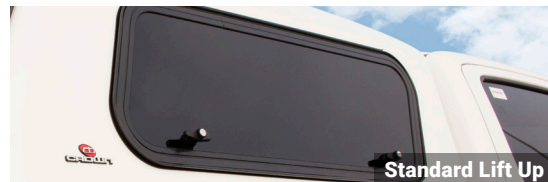
Standard Lift Up