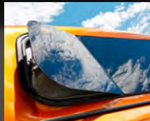
FLUSH MOUNT SCISSOR