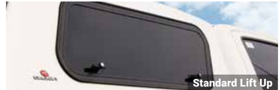
Standard Lift Up