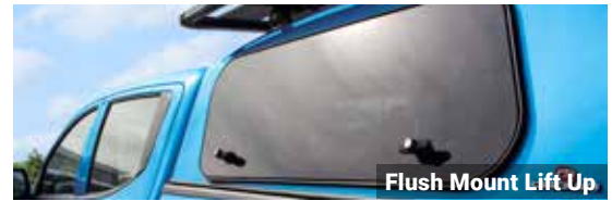
Flush Mount Lift Up