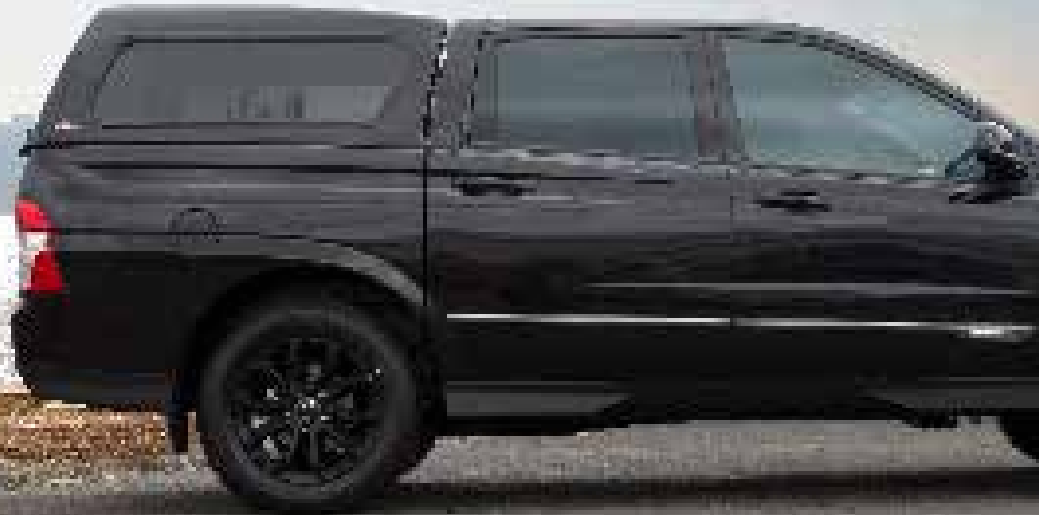
SsangYong Actyon Double Cab with standard sliding windows