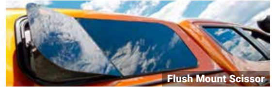
Flush Mount Scissor