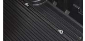
COMPATIBLE WITH CORE TRAX