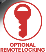
OPTIONAL REMOTE LOCKING