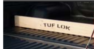
COMPATIBLE WITH TUF LOK