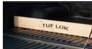
COMPATIBLE WITH TUF LOK