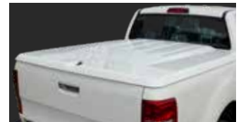
ONE PIECE LID