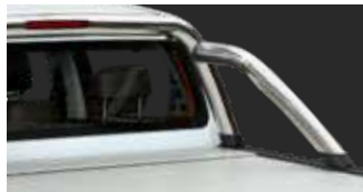
OPTIONAL SPORTS BAR