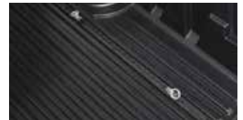
COMPATIBLE WITH CORE TRAX