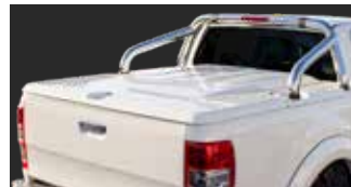
THREE PIECE LID