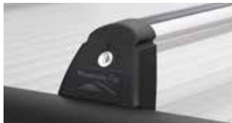
OPTIONAL CARGO CARRIERS