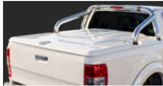
THREE PIECE LID