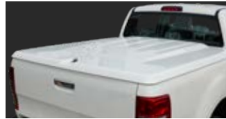
ONE PIECE LID