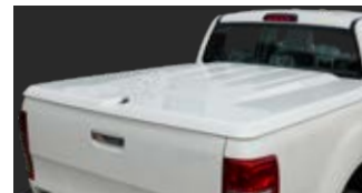
ONE PIECE LID