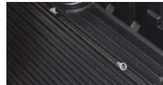
COMPATIBLE WITH CORE TRAX