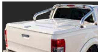
THREE PIECE LID