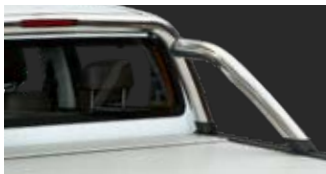
OPTIONAL SPORTS BAR