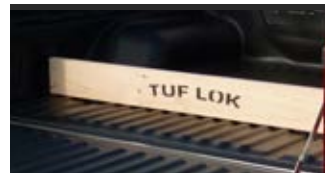
COMPATIBLE WITH TUF LOK