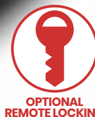
OPTIONAL REMOTE LOCKING