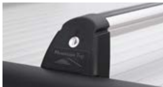
OPTIONAL CARGO CARRIERS