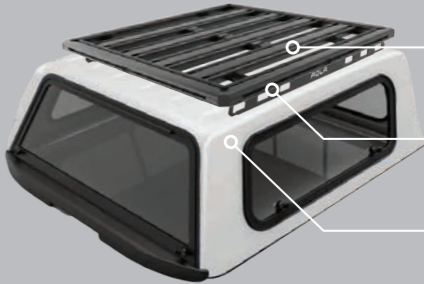
Rola Titan Tray

The Rola Titan Tray is built for strength and versatility, combining lightweight yet durable materials with smart engineering. Designed for demanding conditions, it features internal mounting bars for secure load attachment and customisation. Certified and tested for heavy loads, the Titan Tray delivers reliability and peace of mind, whether you're tackling tough terrain or daily transport needs.